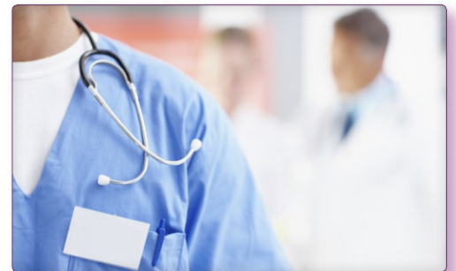
GCSE re-sit learners