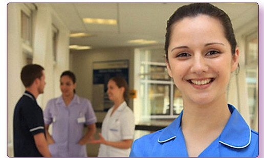
Access to Nursing